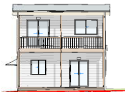
South West elevation