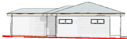
North West elevation -Granny flat

Purpose: Development application only (DA) For any further inquiries please contact us for properly advice Any design and drafting will remain the property of giantA