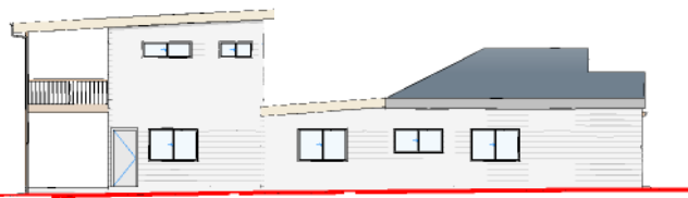
South East elevation