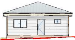
South West elevation -Granny flat